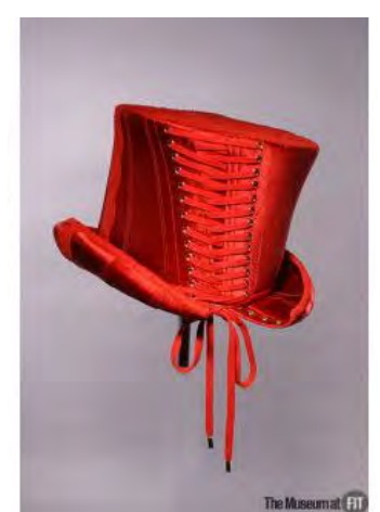
Christian Dior (Stephen Jones), top hat, fall 2000, France.

In today's era of globalization, foreign designers often choose to show their collections in Paris, home to luxury conglomerates such as LVMH and Kering. In a world with many fashion cities, Paris defends its title of world capital of fashion by producing and maintaining the aura of Paris fashion.