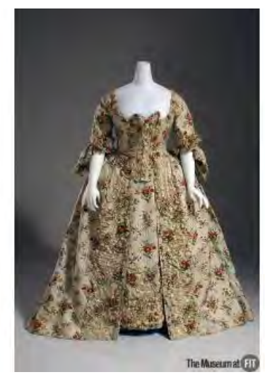
Robe à la française , 1755–1760, France.

Curated by Dr. Valerie Steele, director of The Museum at FIT, it will feature approximately 100 objects, dating from the 18th century to the present. The exhibition will be accompanied by a scholarly book, Paris, Capital of Fashion (Bloomsbury, 2019), edited by Steele, who is also the author of Paris Fashion: A Cultural History . In addition, there will be a free symposium on October 18, 2019.