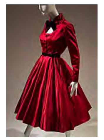
Jacques Fath for Joseph Halpert, cocktail dress, 1952, USA.