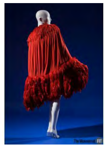
Gabrielle Chanel, evening cape, 1927, France.

The development of the haute couture transformed women's fashion from an artisanal craft into big business and high art. In the late 19th century, Charles Frederick Worth praised his American clients, saying they had "the faces, the figures, and the francs." Among his dresses on display is the famous "Electric Light Dress" worn by New York's Mrs. Cornelius Vanderbilt II. After World War II, the haute couture entered a new golden age from 1947 to 1957 and, by the 1980s, the haute couture was recognized as part of the unique patrimony of France.