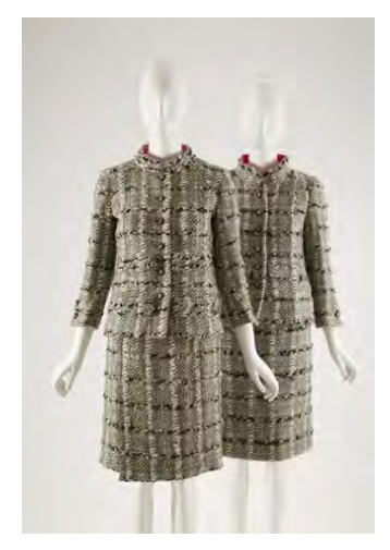
(L) Suit by Gabrielle Chanel, 1966, France. (R) Licensed copy of a Chanel day suit, c. 1967, USA.